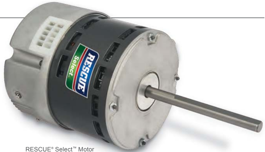
RESCUE® Select™ Motor