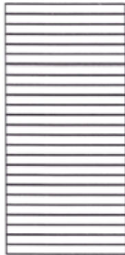
# DP-RAIL (Drain Pan w/Support Rails)

25 Drain Pans both straight and flaring, showing the remarkable savings in storage space made possible by nestable pans.