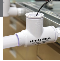
Can be installed in a horizontal or vertical position