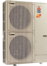
Outdoor Unit: PUZ-HA36NHA4