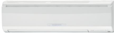
Indoor Unit: MSZ-GE24NA