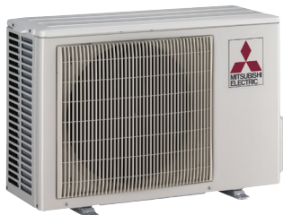
Outdoor Unit: MU-A09WA