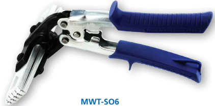
MWT-SO6 Offset Seamer