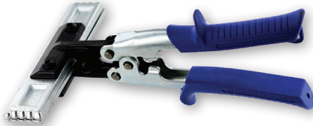
MWT-S6 Straight Seamer