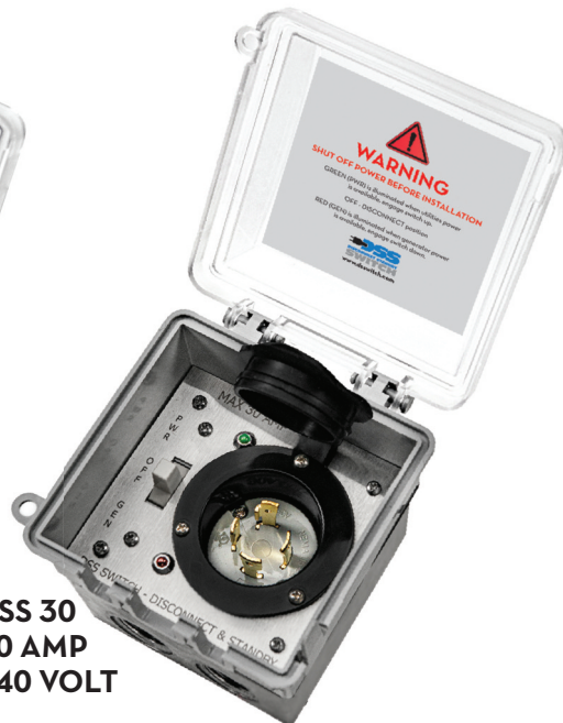
DSS 30 30 AMP 240 VOLT

Electrical codes require all condensers to be fitted with a disconnect switch, and this is the primary function of the DSS Switch.