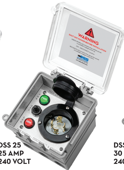
DSS 25 25 AMP 240 VOLT