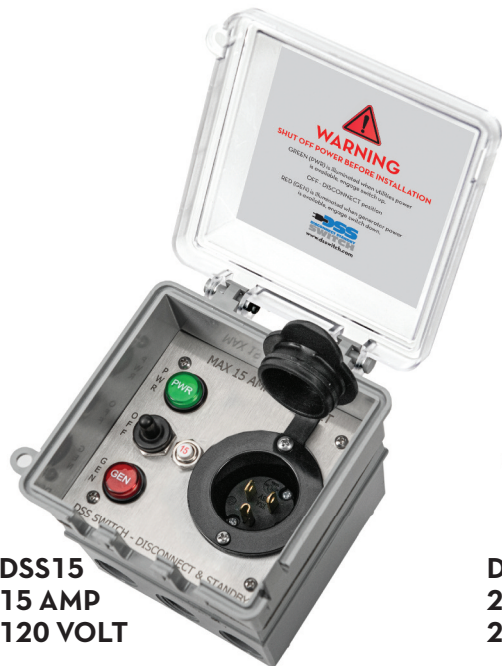
DSS15 15 AMP 120 VOLT