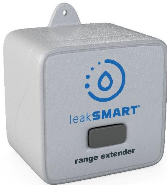
System range extender operates with AC power

Input AC Voltage: 100-240 VAC, 50/60 Hz Maximum Current Drain 0.07A Operating Temperature Range -20°C to 40°C [-4°F to 104°F] AC input IEC Type A, ungrounded, non-polarized