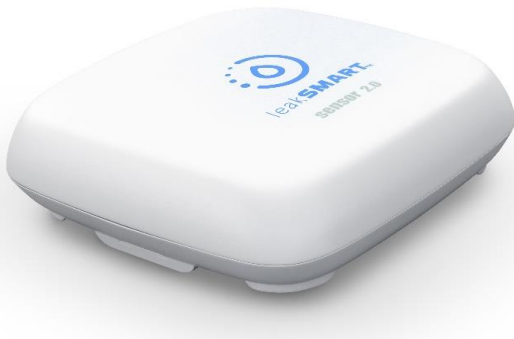
Sensor operates with batteries (batteries included)