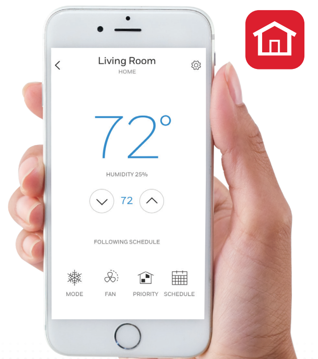
T6 Pro Smart Thermostat