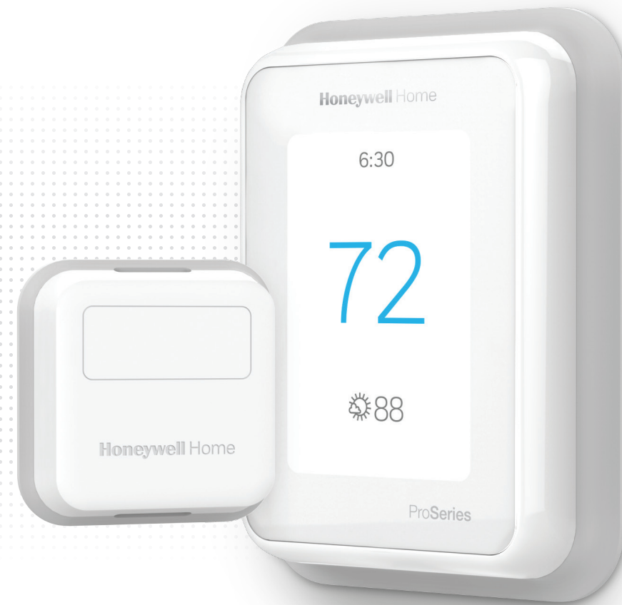
T10 Pro Smart Thermostat with RedLINK™ Room Sensor

Meet the next generation of everyday comfort solutions.