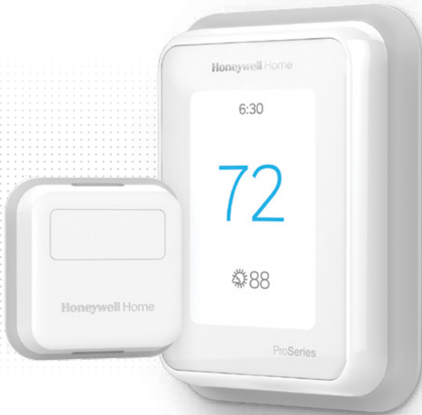
T10 Pro Smart Thermostat with RedLINK™ Room Sensor

Meet the next generation of everyday comfort solutions.