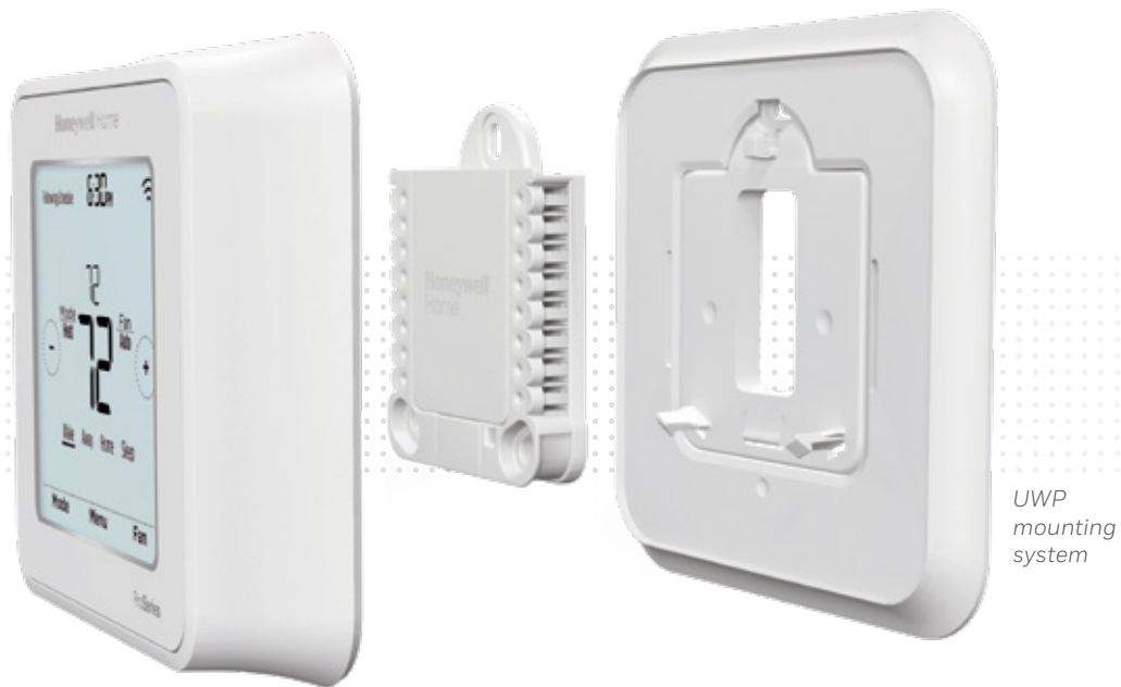
UWP mounting system