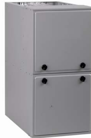
Illustrations and photographs are only representative. Some product models may vary.

* Applies to original purchaser/homeowner, some limitations may apply. See warranty certificate for complete details.