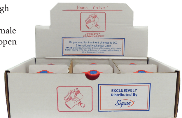
6 Pack Counter Display