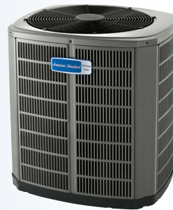
AccuComfort™ Platinum 18