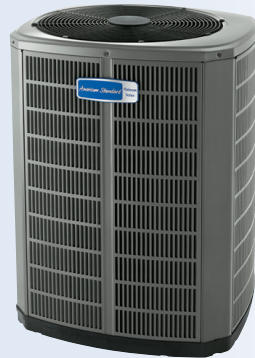
AccuComfort™ Platinum 20

American Standard Platinum air conditioners offer our highest combination of performance, efficiency, and temperature control. Built with American Standard's commitment to quality throughout, the Platinum line offers advanced energy-saving features like Duration™ variable speed compressors and Spine Fin™ coils.