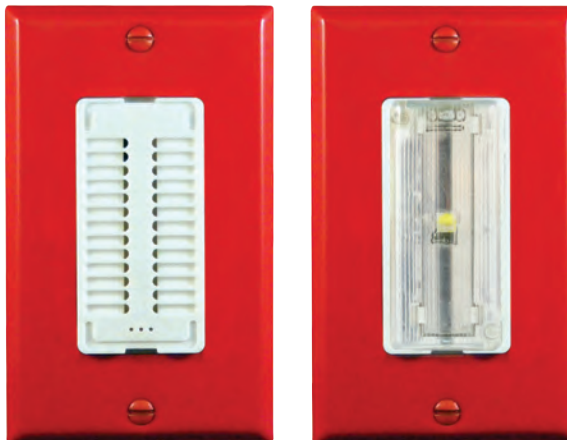
MSR-A & MSR-AV

For use with UL Listed 24VDC polarized power circuits.