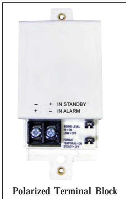
Polarized Terminal Block