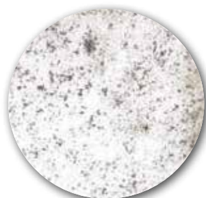
Standard plastic pan with visible mold

Microbes can double every 20 minutes on an untreated surface!