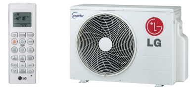
High Wall Duct-Free Art Cool™ Mirror High Efficiency