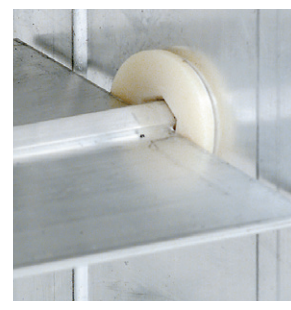
Parallel blade with extruded lip for low leakage.