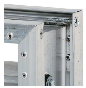
Durable construction — riveted and screwed corners.