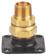
Termination Fitting with Square Flange