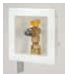
XR Outlet Box