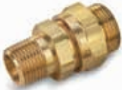
Termination Fitting with No Flange