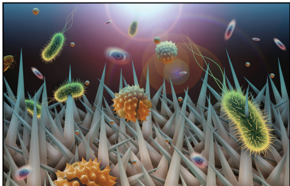
Microbes are destroyed by microscopic structure of Goldshield™