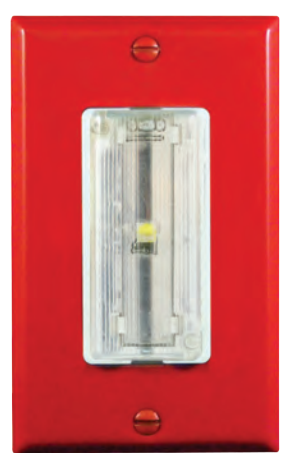
MSR-A & MSR-AV