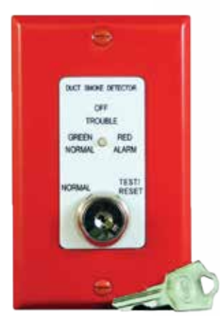
MSR-50RM/R & MSR-50RK/R

The MSR-50R Series indicator/control assemblies provide: